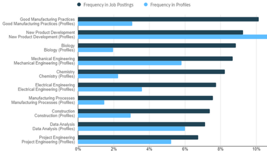
Top Specialized Skills

Upon examination, the most in demand specialized skills across STEM occupations recruited for by North County companies were identified.