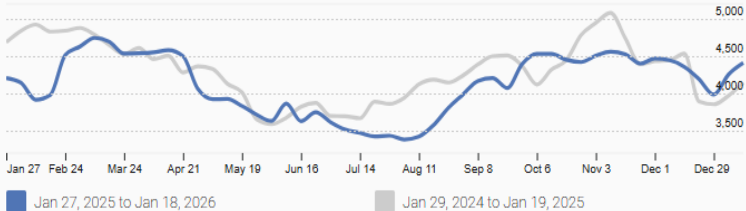
Active Job Ads by Date

Source: JobsEQ®, See JobsEQ online Help for important Technical Notes.